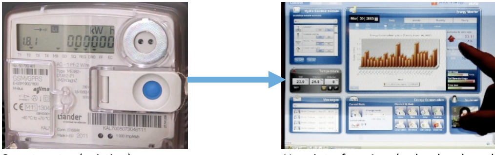
Smart meter (existing)